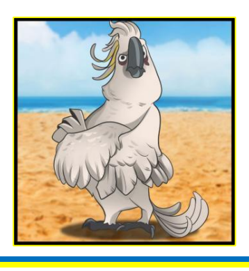
Reporter-at-Large, ACT Masters Hockey Assn