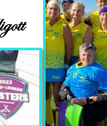
Victorious Australian O/65 Team